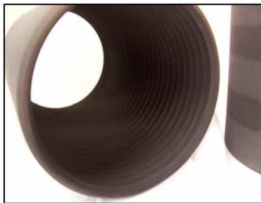
Cleaned using ThermaGas® process